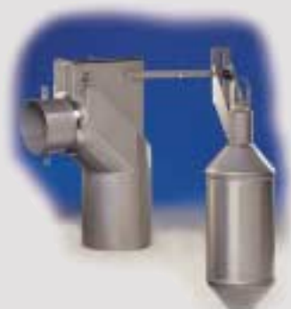
Ecosep's oil-spill control Ecostop (patent pending).

separation system to provide maximum security for the facility owner against unexpected, unpredictable and catastrophic petroleum spills.