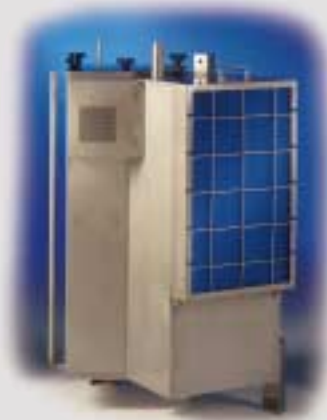
Ecosep's compact outlet structure with easy to clean coalescing filter and oil recipient.

provides an effluent sampling port. The separated water that leaves the Ecosep has a residual contamination of free petroleum content of less than 5 mg/liter.