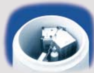
Full access to all major elements makes Ecosep easy to operate and maintain.

fluctuations, influent oil concentration influxes and initializes the separation of light fluids. A perforated 90-degree outlet tube retains floating solids from entering the separation chamber.